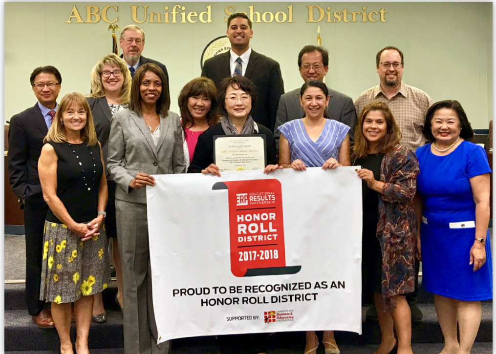
ABCUSD Honored as an Honor Roll District

Thank you for your support throughout this new school year. For more information about ABCUSD, please check out our new website at: https://www.abcusd.us . I look forward to another great school year in ABCUSD! ▀