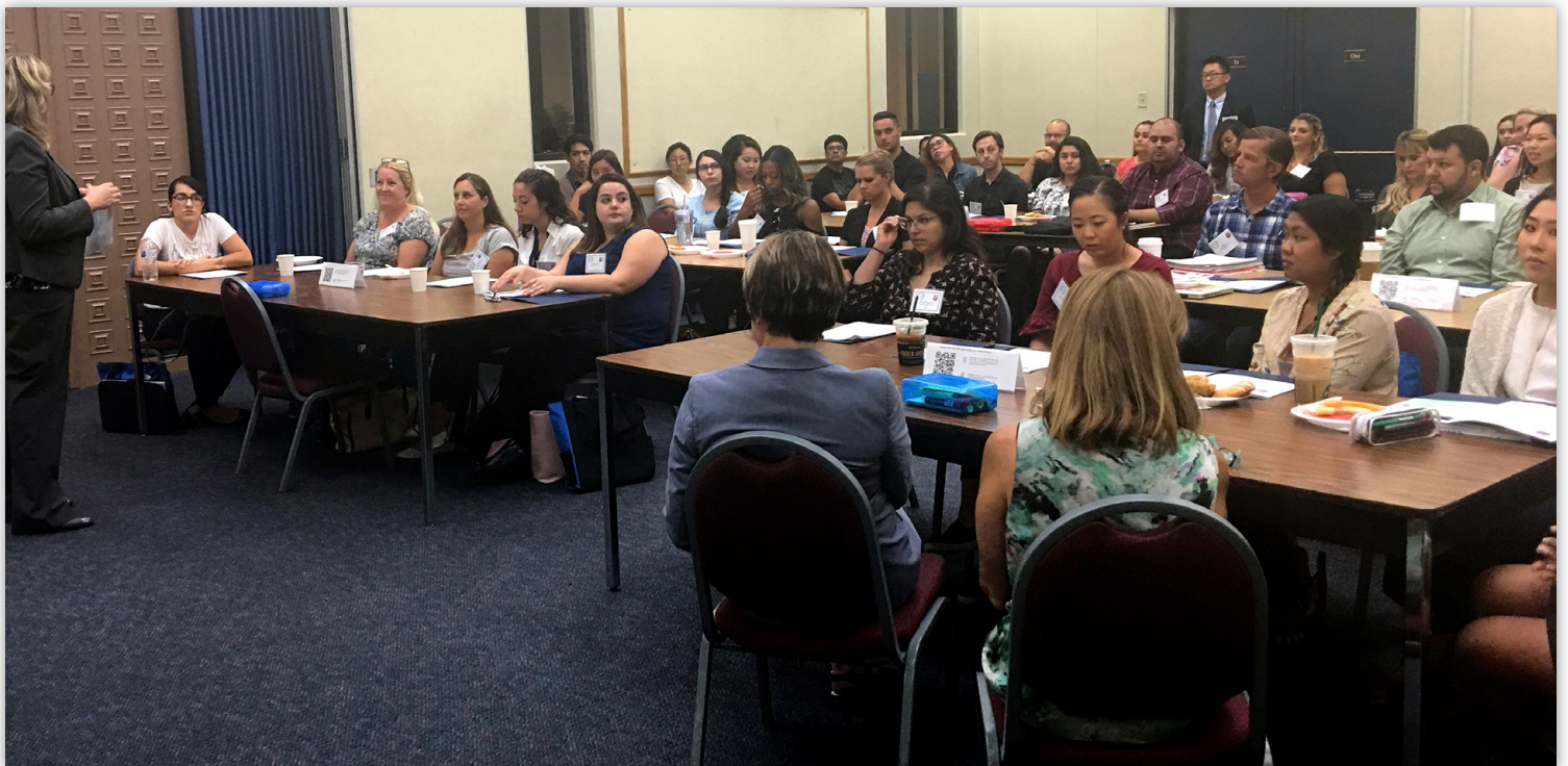
New Teachers Orientation held on August 16, 2018

The New Teacher Orientation was held on Thursday, August 16, 2018. The New Teacher Orientation provided new teachers with an overview of support from Academic Services, Information Technology, Teacher Leaders, and ABCFT. Information around professional conduct, employee safety, and fiscal services were provided as well. In the afternoon, our new Special Education teachers were given additional training on our student information system for producing the Individual Education Plans (IEPs) for students and families. ▶