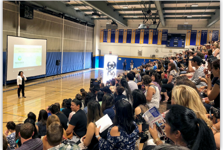
Teaching and Learning Institute at Artesia HS and Gahr HS